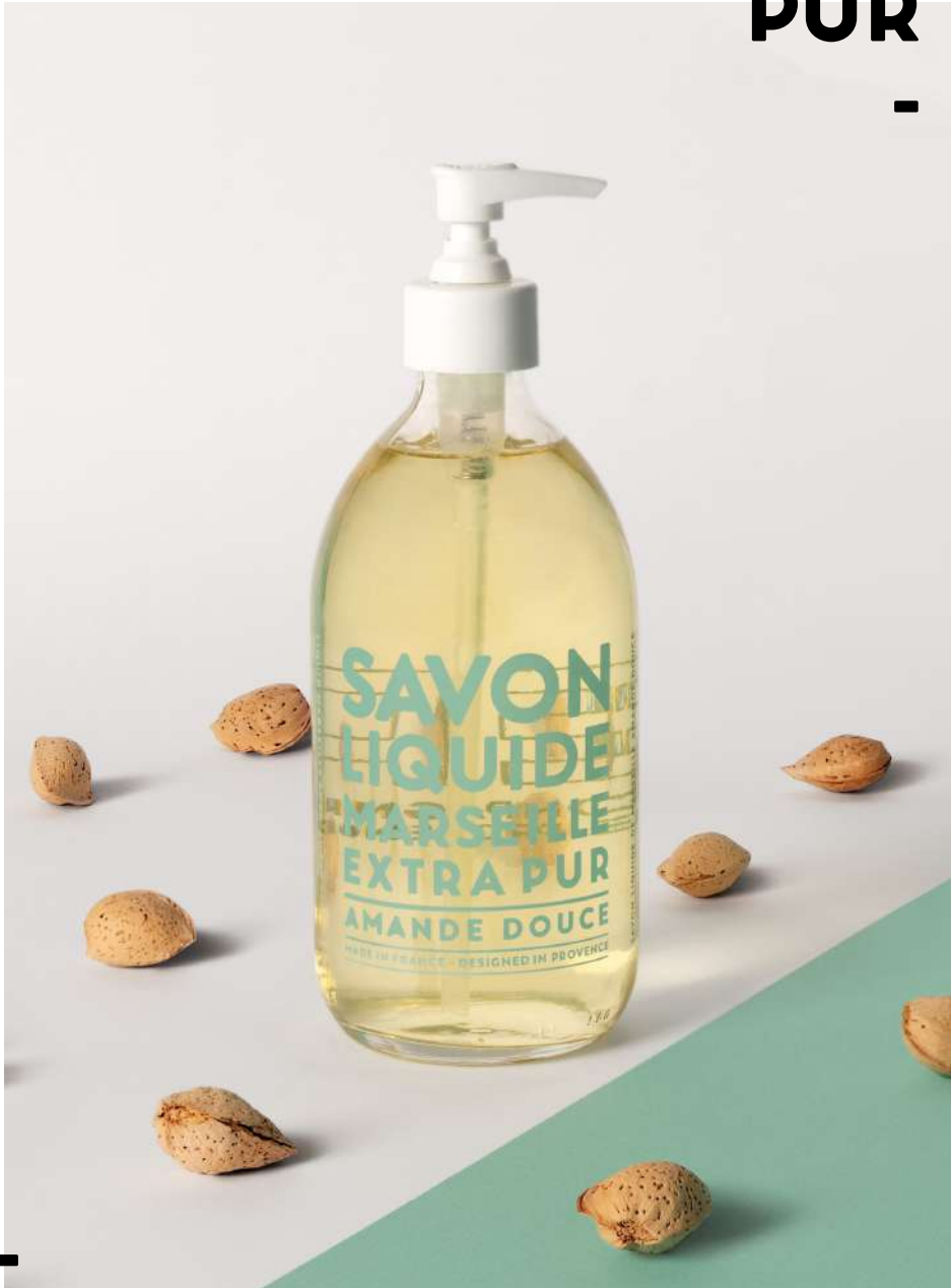
The original liquid Marseille soap

Add a fun and colorful touch to everyday life.